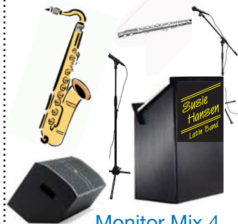
Monitor Mix 4