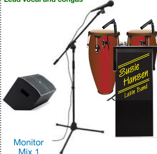
Monitor Mix 1