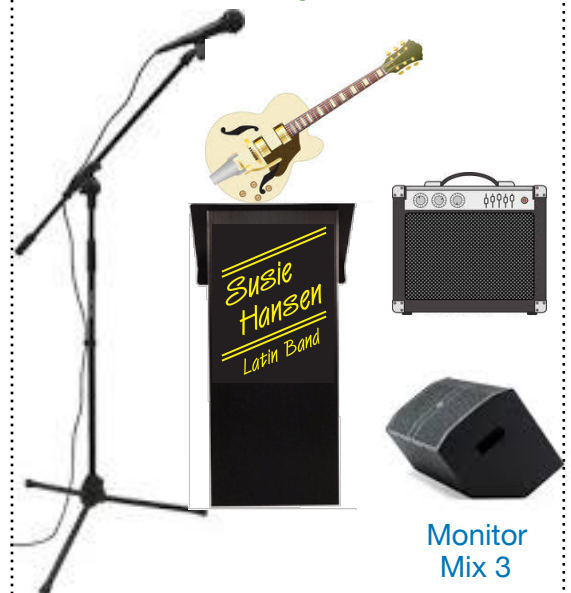
Monitor Mix 3