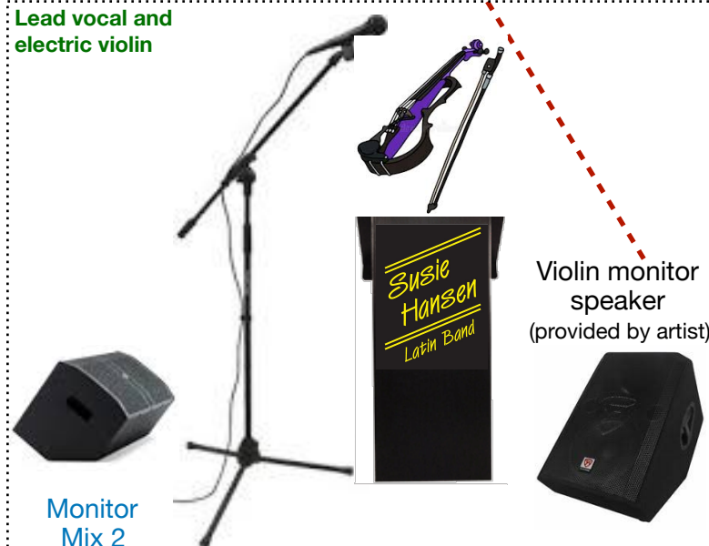
Monitor Mix 2