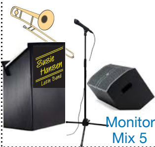
Monitor Mix 5