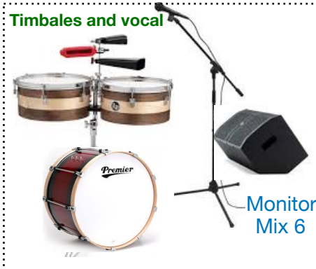
Monitor Mix 6